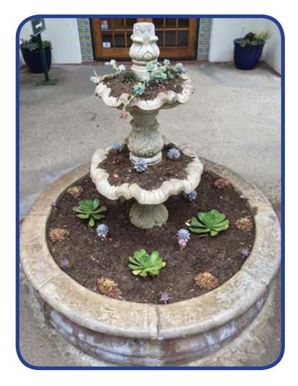
The District's leaking fountain has been re-purposed as a planter for succulents which require very little water.

The District's water has a hardness range of 19 to 25 grains per gallon. One grain per gallon equals 17 milligrams per liter.