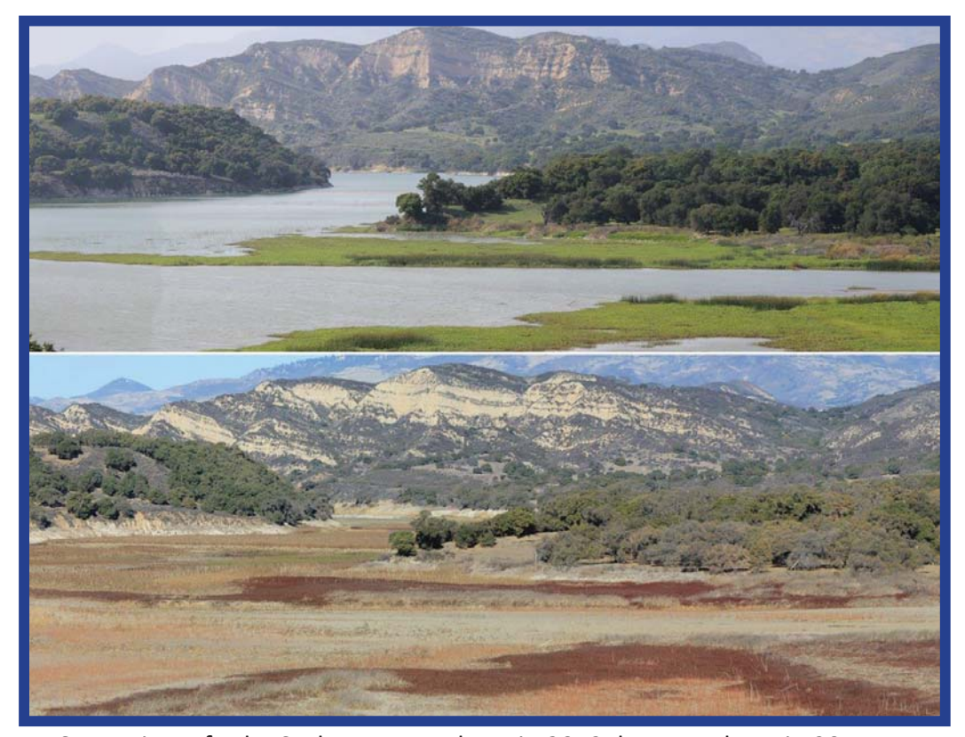
Same view of Lake Cachuma, top photo in 2012; bottom photo in 2014. We must continue to conserve water, we don't have any water to waste!

Carpinteria Valley Water District 1301 Santa Ynez Avenue Carpinteria, CA 93013