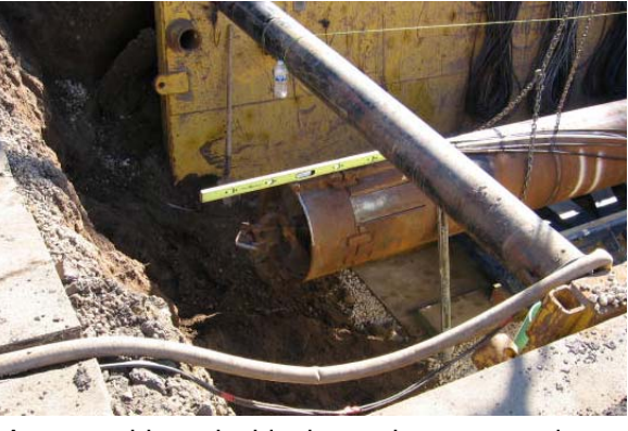
An auger bit set inside the casing was used to displace material as the casing was pushed through the soil. The casing was pushed completely under US 101 from Cramer Road to Cramer Circle.