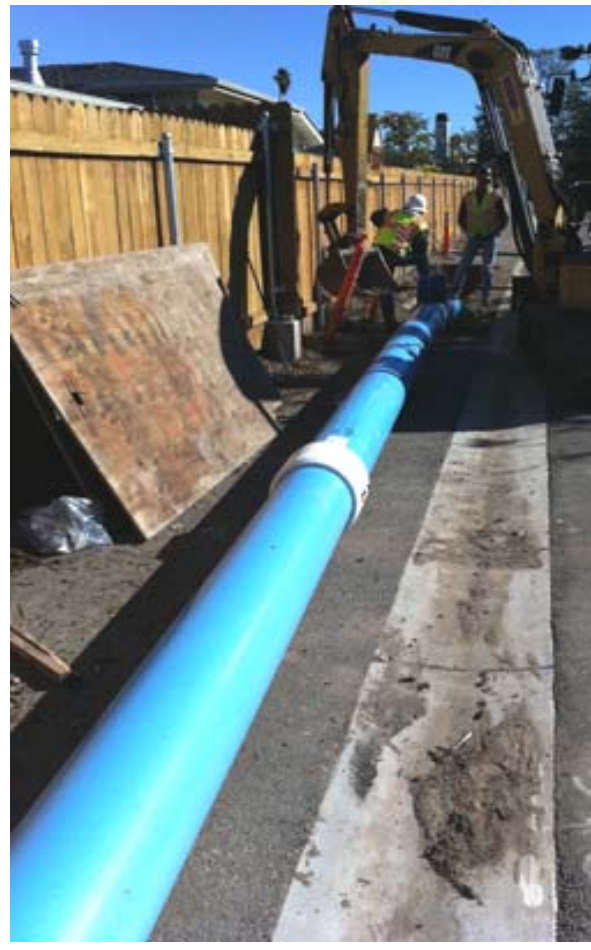
Once the drill hole was completed the pipe was then pulled back through the open hole by the drill rig.

El Districto es bilingue. Favor de llamar (805) 684-2816 con cualquier pregunta sobre su cuenta o el uso de agua, estamos aqui para asistirlos.