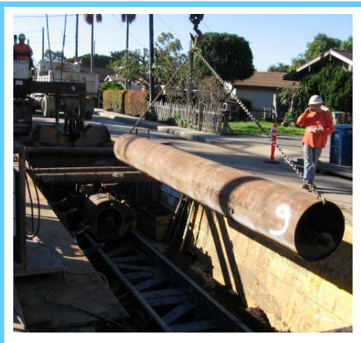
A section of casing is shown being hoisted into the" jack and bore" pit located at the end of Cramer Road.