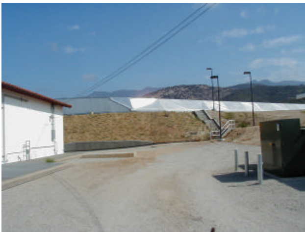
Views of the Carpinteria Reservoir cover.

This $1.8 million well and iron and manganese filtration plant project is now almost completed. The well is a big producer, capable of up to 1,500 gallons per minute. The well project has been expanded to include injection capabilities with the assistance of a $125,000 grant from the Department of Water Resources. This new well replaces the loss of groundwater supply associated with a failed well on the same District headquarters site nearby. A low interest loan from the Department of Health Services is funding this project.