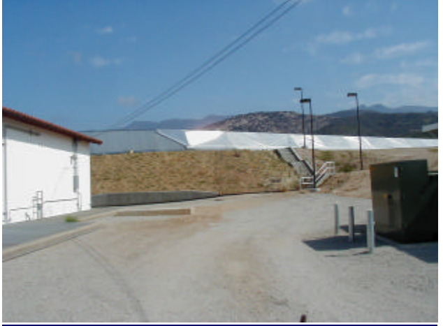
Views of the Carpinteria Reservoir cover.

This $1.8 million well and iron and manganese filtration plant project is now almost completed. The well is a big producer, capable of up to 1,500 gallons per minute. The well project has been expanded to include injection capabilities with the assistance of a $125,000 grant from the Department of Water Resources. This new well replaces the loss of groundwater supply associated with a failed well on the same District headquarters site nearby. A low interest loan from the Department of Health Services is funding this project.