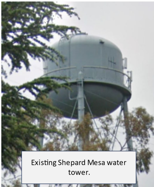
Existing Shepard Mesa water tower.