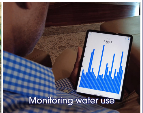
Monitoring water use